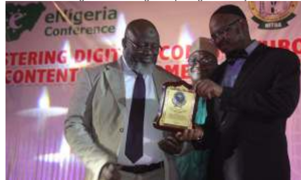
Minister of Communication, Barr. Adebayo Sittu, 2017 Africa ICT Personality Award Winner. Presented by DG NITDA, Dr Isa Ali Ibrahim Pantami