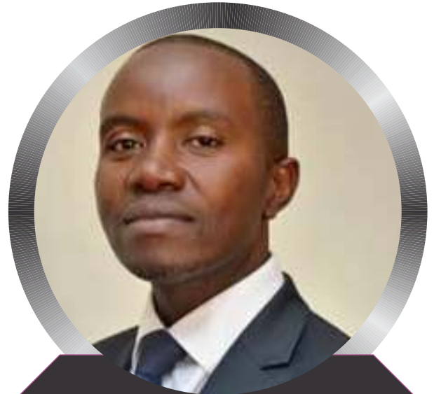
Hon. Joseph Mucheru Minister for Information, Communication & Technology