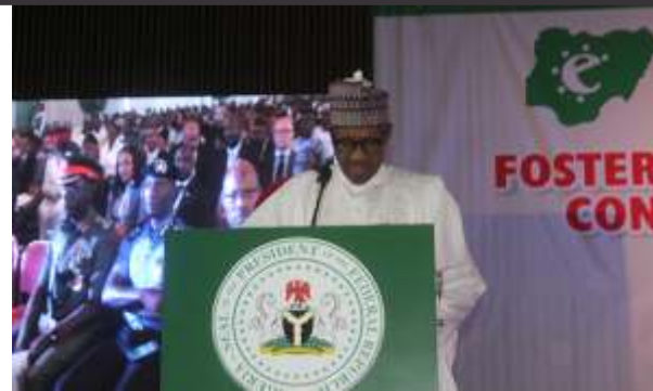
His Excellency Muhammadu Buhari, GCFR President Federal Republic of Nigeria @ the eNigeria Opening Ceremony