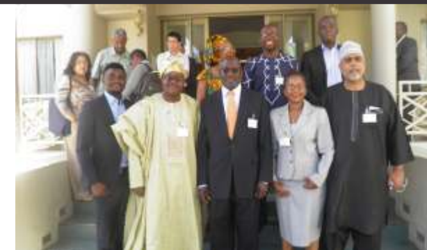
The Chair AfICTA and some summit delegates with the Minister of ICT Namibia, Hon. Tjekero Tweya