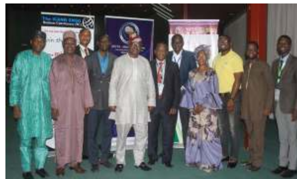
AfICTA Board and Stakeholders pose shortly after the Annual General Meeting