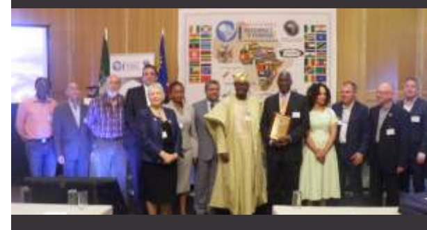
Resource Persons with the Minister of ICT Namibia, Hon Tjekero Tweya shortly after receiving Award