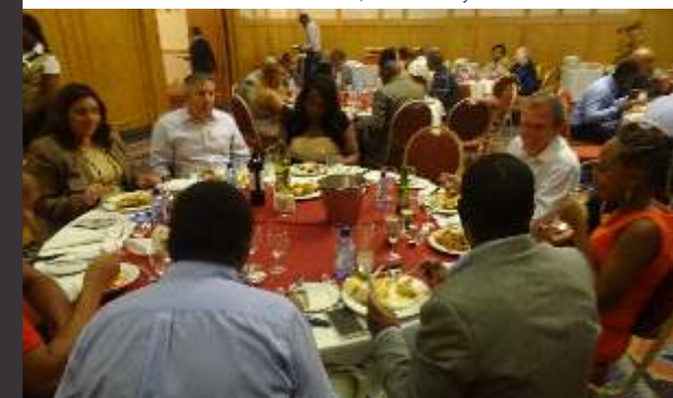
Participants at the Gala Dinner and Award Night