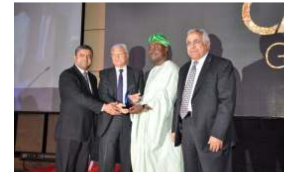
AfICTA's Award of Patron to Eng Atef Helmy, Minister of C&IT, Egypt for his strong support towards the success of AfICTA Summit