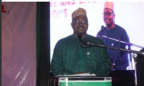
Chair AfICTA delivering his Message @ the AfICTA Opening Ceremony