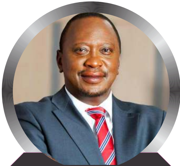
Uhuru Muigai Kenyatta President of the Republic of Kenya