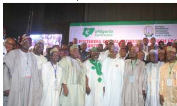
Dignitaries & Participants pose with the President and Commander in Chief of Nigeria, Muhammadu Buhari shortly after the Opening Ceremony