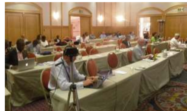
Cross-sectional view of Participants During the Summit