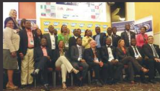
AfICTA Board with some of the Summit Delegates