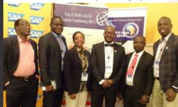
AfICTA Chair and other Summit Participants