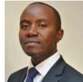
Hon. Joseph Mucheru Minister for ICT