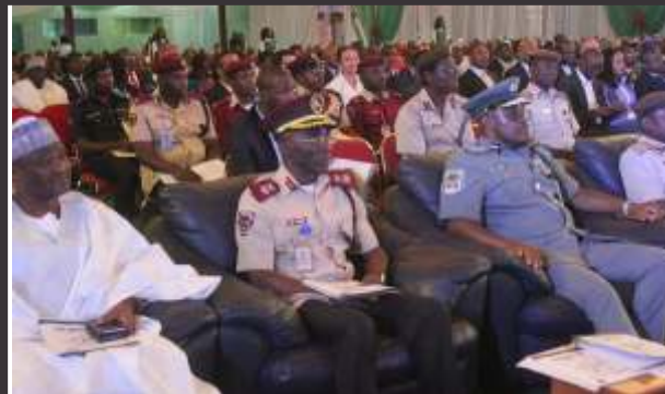
Cross-sectional view of participants @ the eNigeria and AfICTA Opening Ceremony